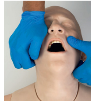
Head tilt, chin lift and jaw thrust