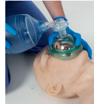
Ventilation with BVM