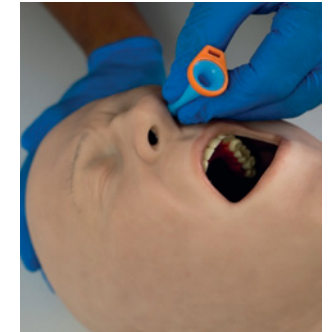
Oropharyngeal and nasopharyngeal airway insertion