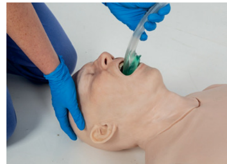
Supraglottic airway insertion

Supports supraglottic airway insertion, endotracheal intubation and mechanical ventilation